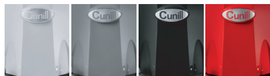
WHITE GREY BLACK RED