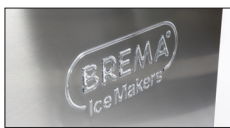
AISI 304 SS Scotch Brite finish