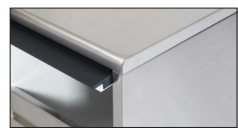
Disappearing insulated door