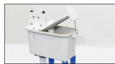
Dust-proof water basin