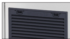
Removable and cleanable air filter