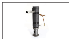
AISI 304 SS evaporator